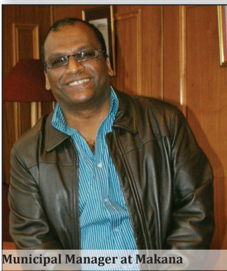
Municipal Manager at Makana