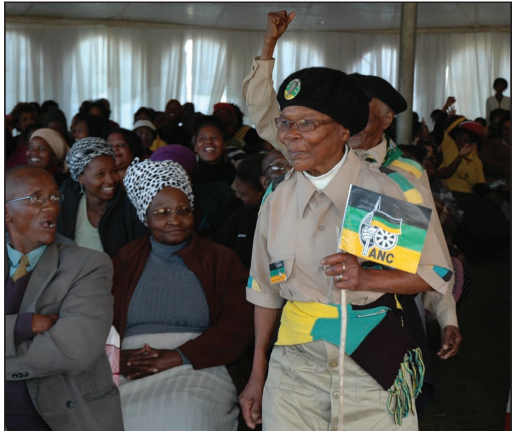
Makana Freedom Festival: Elderly Struggle Veterans March Forward

The Makana Municipality is proud to present its first edition of Makana News to the people of Makana