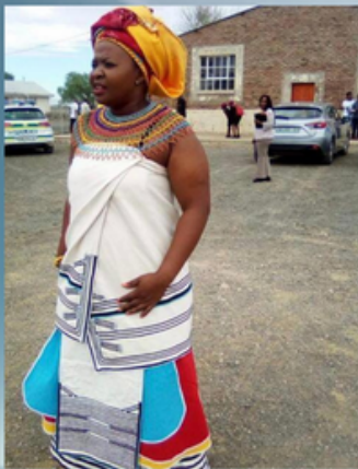
Executive Mayor Cllr Yandiswa Vara