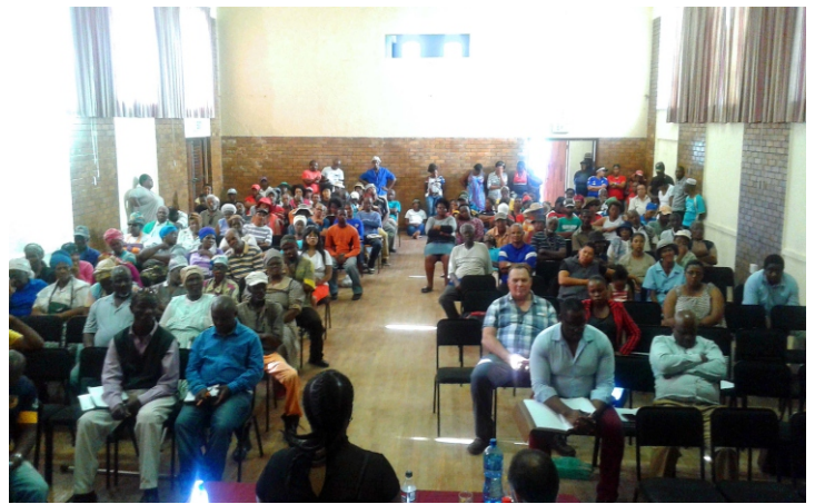
Community members attending and engaging in the Mayoral Imbizo in Alicedale.