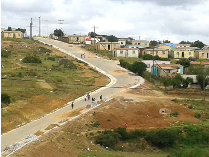
Progress is being made on the Vukani Location taxi route