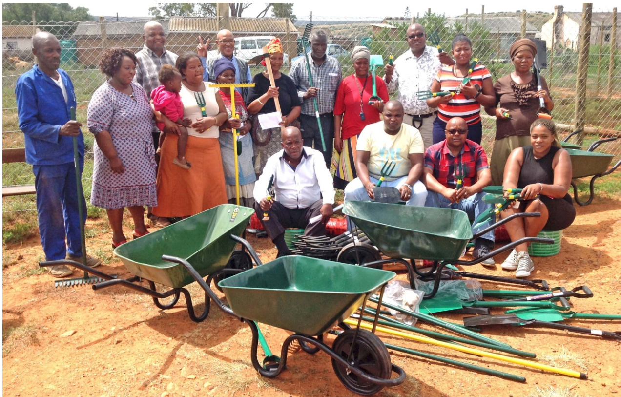
The community of Table Farm received gardening tools handed over by Makana Municipality and DRDAR

M akana Municipality, working with the Department of Rural Development and Agrarian Reform handed over gardening equipment to a community in Table Farm on 4 March 2016. The initiative is a drive to empower rural communities to use their gardening skills to alleviate themselves out of poverty.