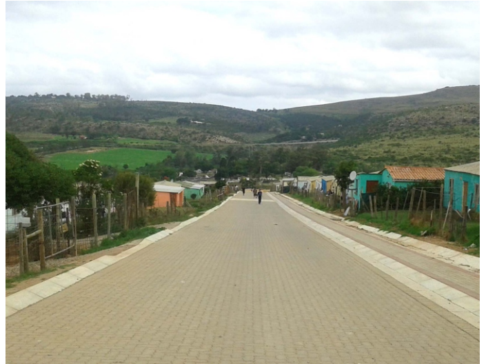
A large part of the roads work in Vukani Location has been completed

A fter living in the dusty streets for the past few years, Vukani Location residents are now living in a less potholed and pollution area. This comes after Makana Local Municipality and the Department of Human Settlement had spent R21 million towards the paving of the taxi route in Vukani Location.